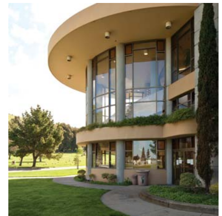
Circle of Peace