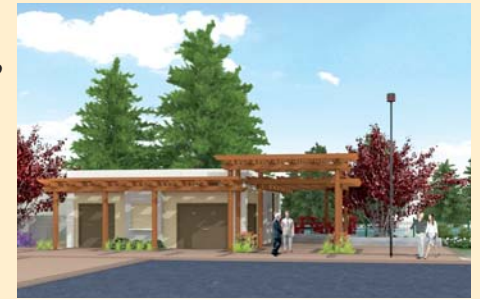
Artist rendition of the finished crematory project

There is an increase in demand and preference for witness cremations. We heard you and are striving to accommodate this request. This crematory project was finished in the fall of 2011.