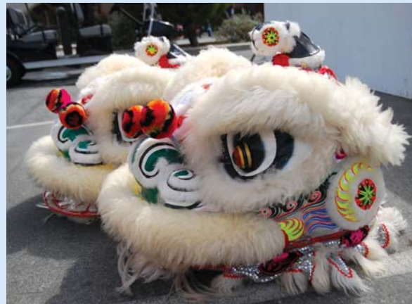
Lions waiting for dancing

Chung Yeung Festival, also known as Autumn Remembrance, is a large tradition in Asian culture. It is a day to respect and remember the ancestors and it is customary to take food, chrysanthemums, wine or tea to picnic on the hillside. It is observed as a time for happy communion with the ancestors rather than a somber occasion. After flying kites, the family enjoys the picnic lunch, which often includes ko and Moon Cake.