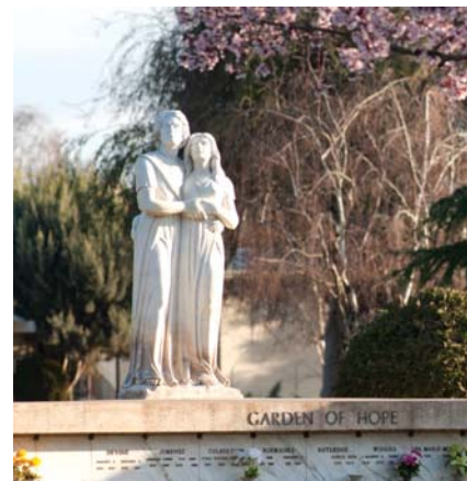
Garden of Hope