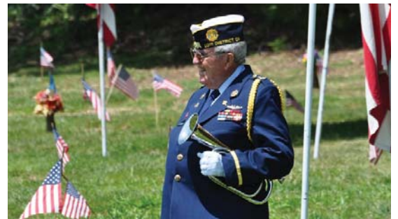
Local VFW bugler before the show