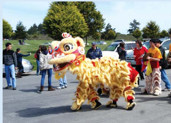
Festivities and Celebration