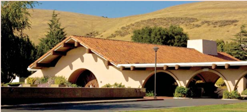
Mission Chapel – Before

Our Mission Chapel is the original building in our park dating back to the late 1800's. Over the years, it was renovated and it is time again to give our beloved building a facelift. The start date is still pending. Please bear with us during this time, as we will do everything possible to accommodate your needs in the meantime.