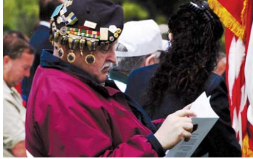
Awaiting the start of our program

Memorial Day is probably one of the biggest events we hold each year. It is very important to us to honor those who have fallen to serve our country, as well as their loved ones left behind. Last year we put out our flags and held a ceremony honoring those here in our park. We worked with our local VFW creating a ceremony complete with color guard, bagpiper, bugler and so much more. We also featured a WWII Era 50 Caliper Machine Gun and provided a BBQ to our families. Please join us next Memorial Day for this inspiring event.