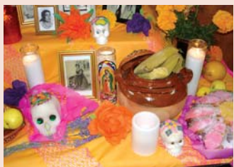
Loved ones photos are placed to honor them