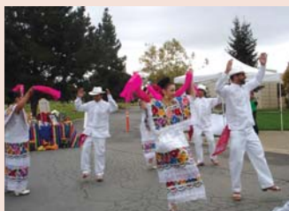
Traditional Latin dancing