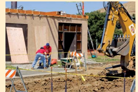
Construction in progress