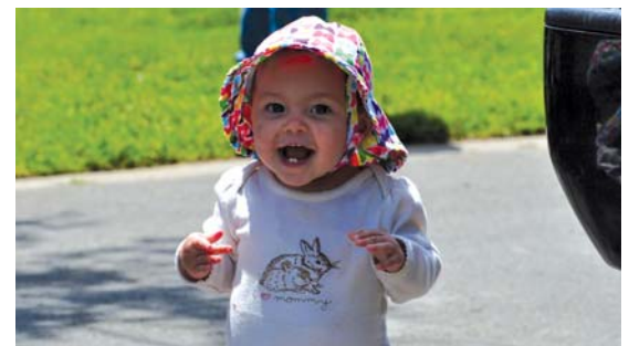
An exciting day out for the family