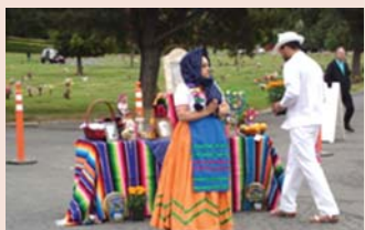
Preparing the offering altar

El Dia De Los Muertos or “Day of the Dead” is a huge tradition in Latin culture. It is a day of celebration where families come to the cemetery and clean the graves of their loved ones who have passed. They leave fresh flowers and offerings which include food and have a picnic while remembering those they love. Traditional Latin dancing and Mariachis are just a few of the features of this event.