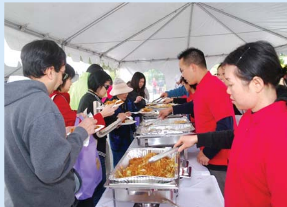
Picnic luncheon after kite flying