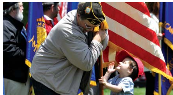
A cherished moment