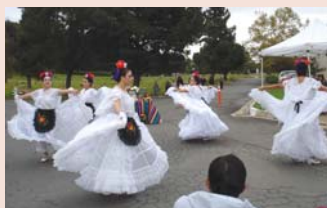
Traditional Latin dancing