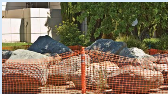
Boulders waiting for the project to start

When completed the new creek will feature statuary, cremation benches and boulders, and flowing water. The start date for this project is still pending.