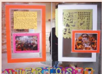
Gallery of offering